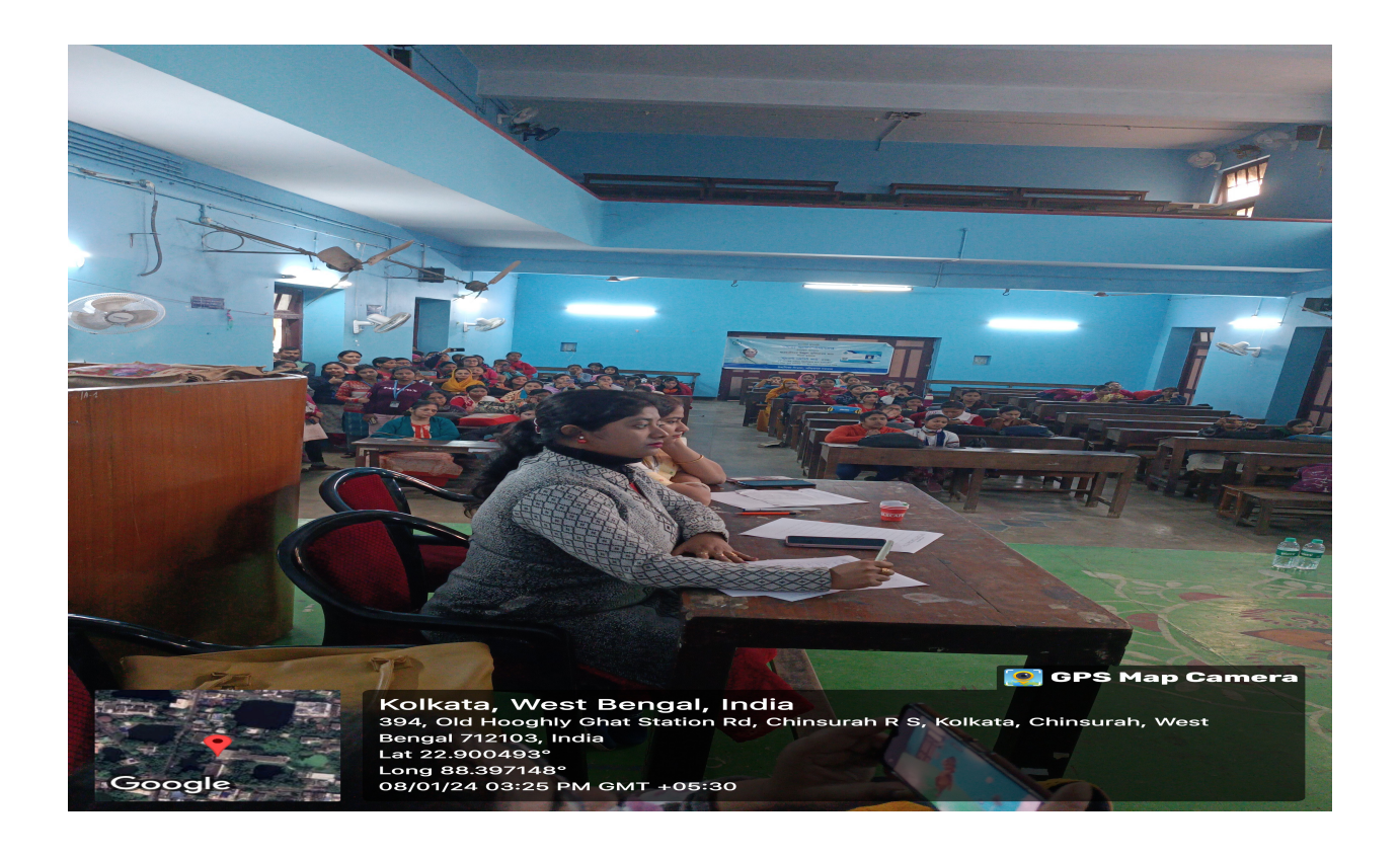
Fig 6: Judge with audience in the cultural competition