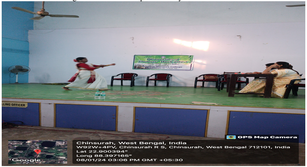
Fig 5: Folk Dance performed by the Student of Sem V