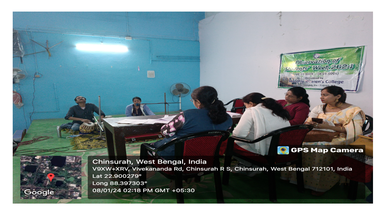
Fig 8: Song performed by the Student of Sem III