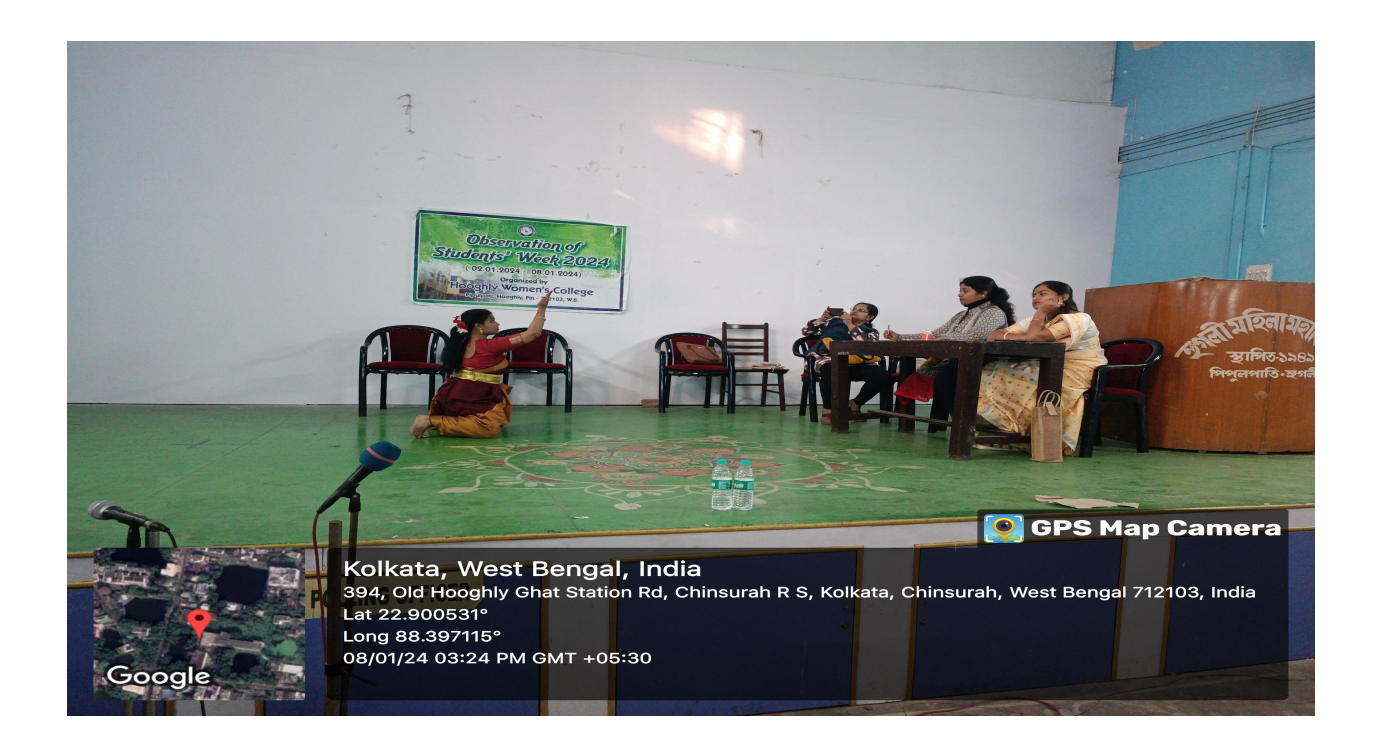
Fig 4: Classical Dance performed by the Student of Sem I