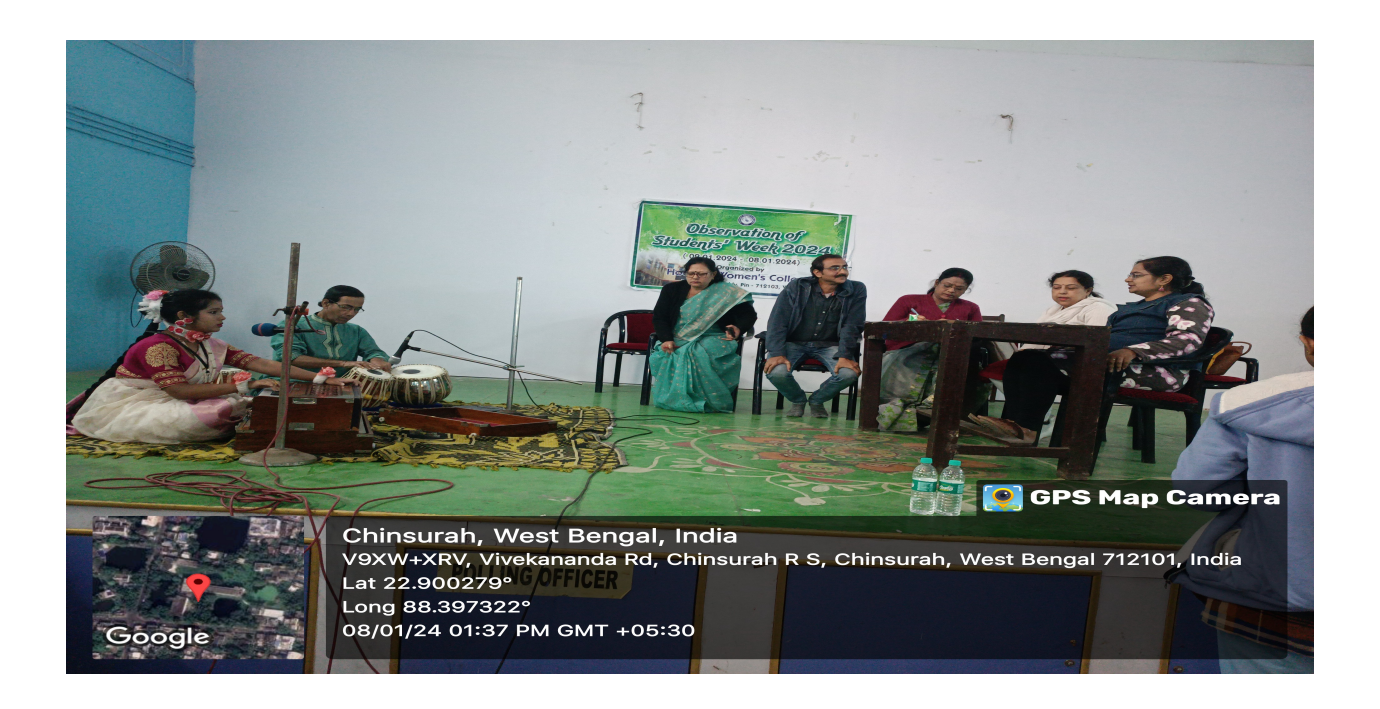
Fig 10: Song performed by the Student of Sem III