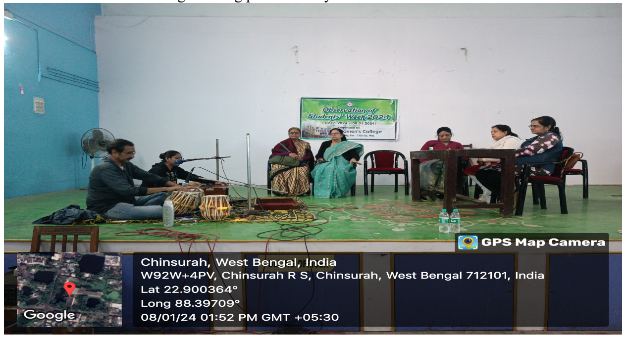
Fig 9: Song performed by the Student of Sem I