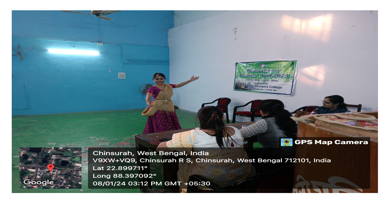
Fig 2: Classical Dance performed by the Student of Sem III